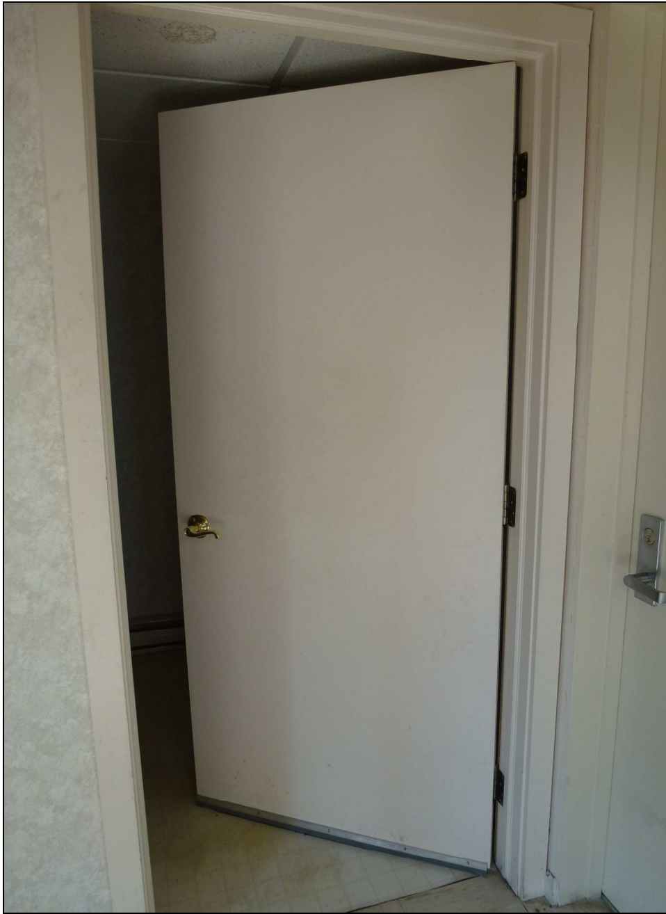
03. Parks Dept Rest Room