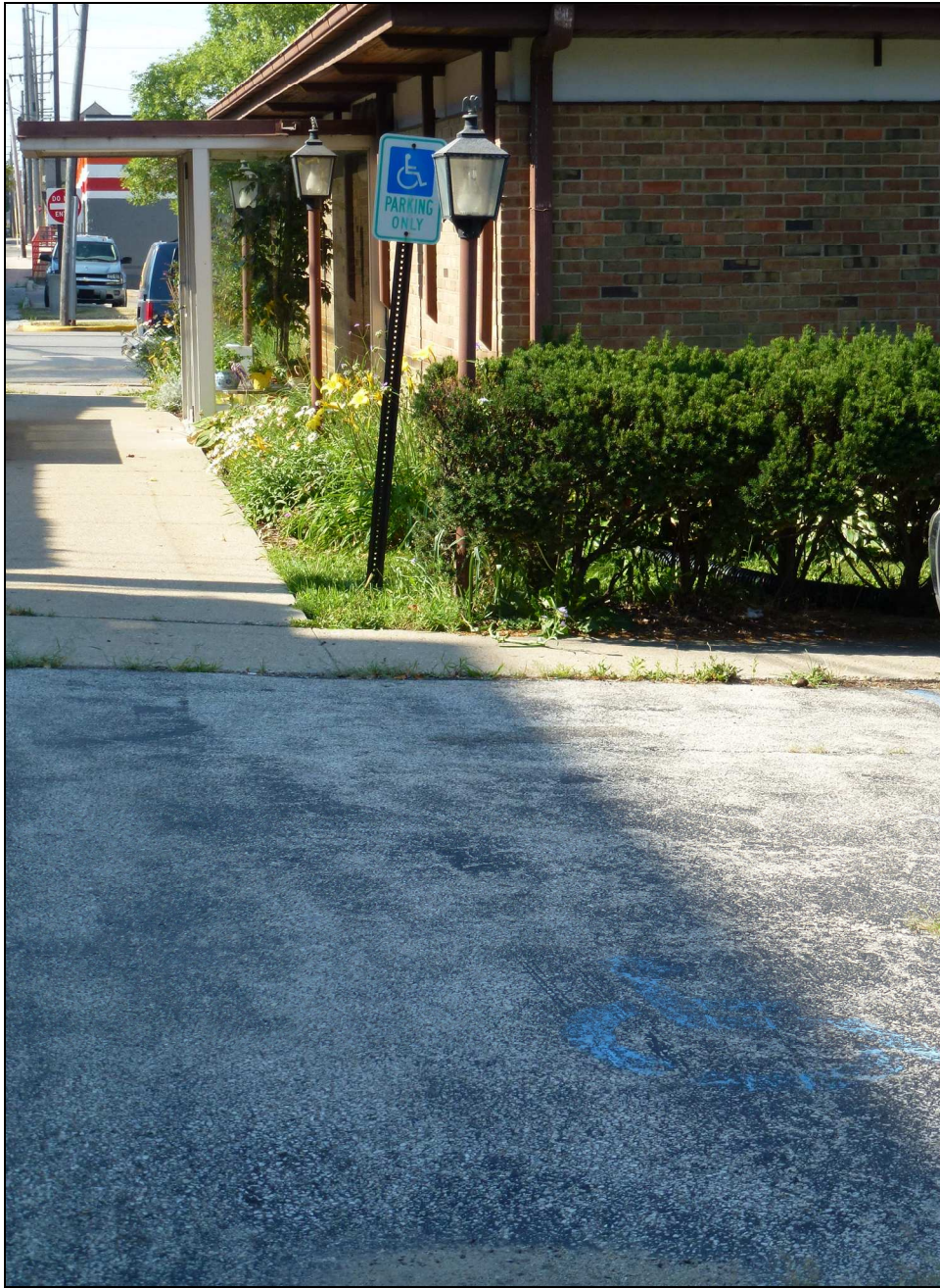
01. Parks Dept Parking Lot