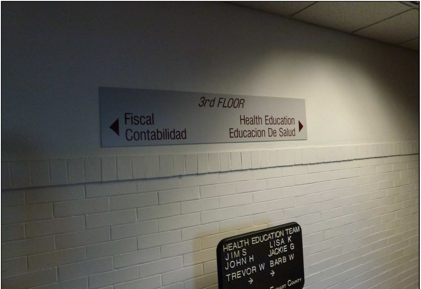
04. Elkhart Health Dept General Signage