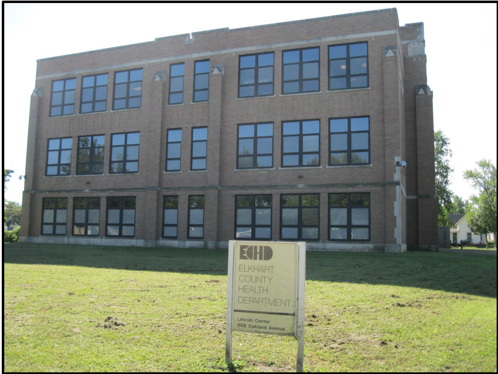
Health Department, Elkhart 608 Oakland Avenue Elkhart, Indiana 46516