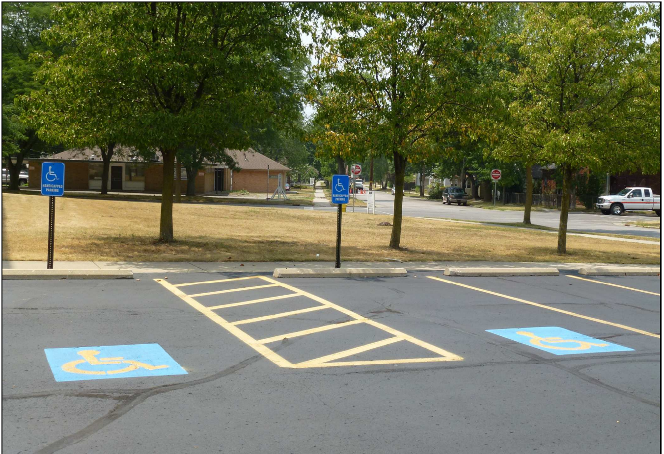
02. Elkhart Health Dept Accessible Parking