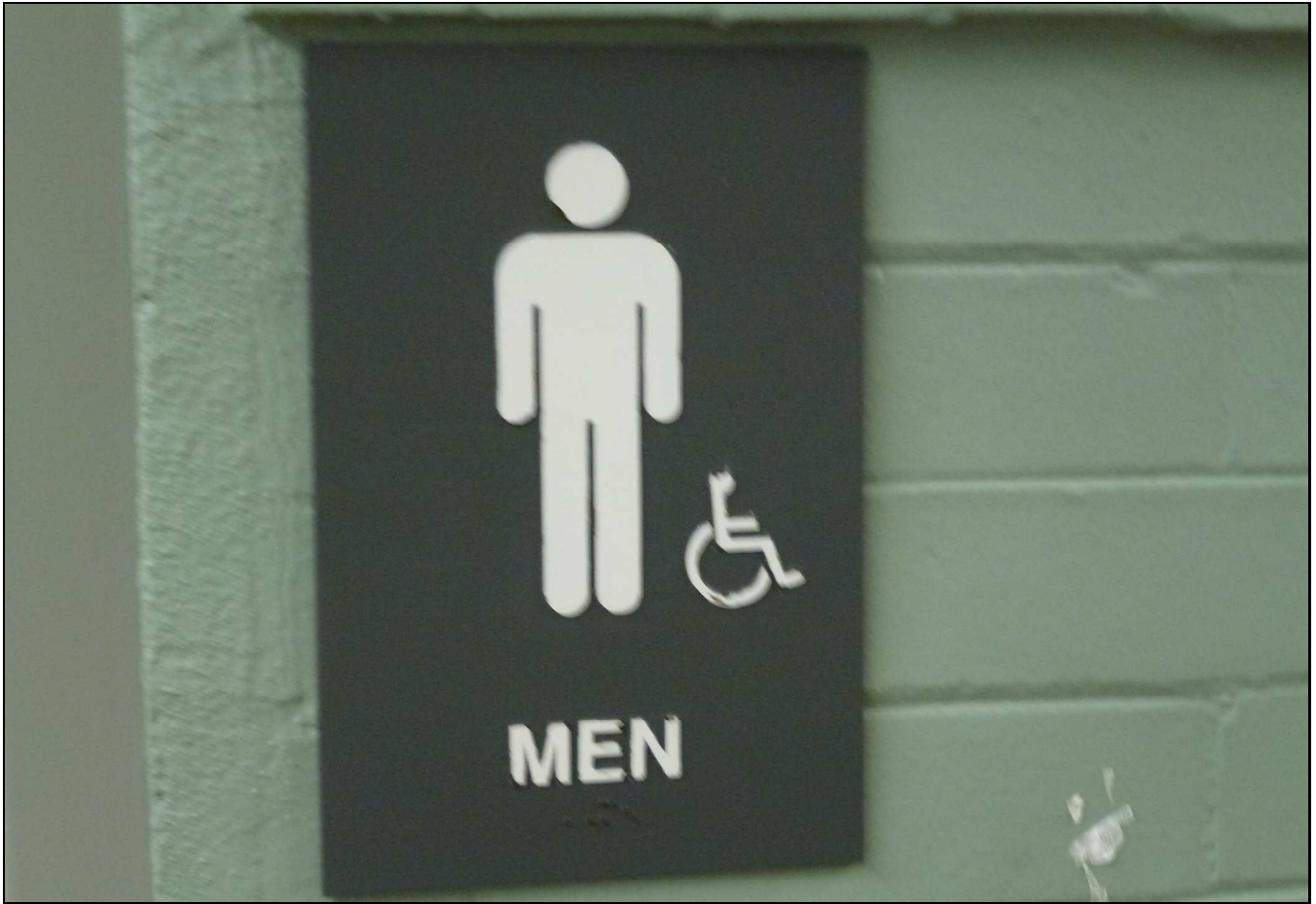
05. Elkhart Health Dept Restroom Signage (2)