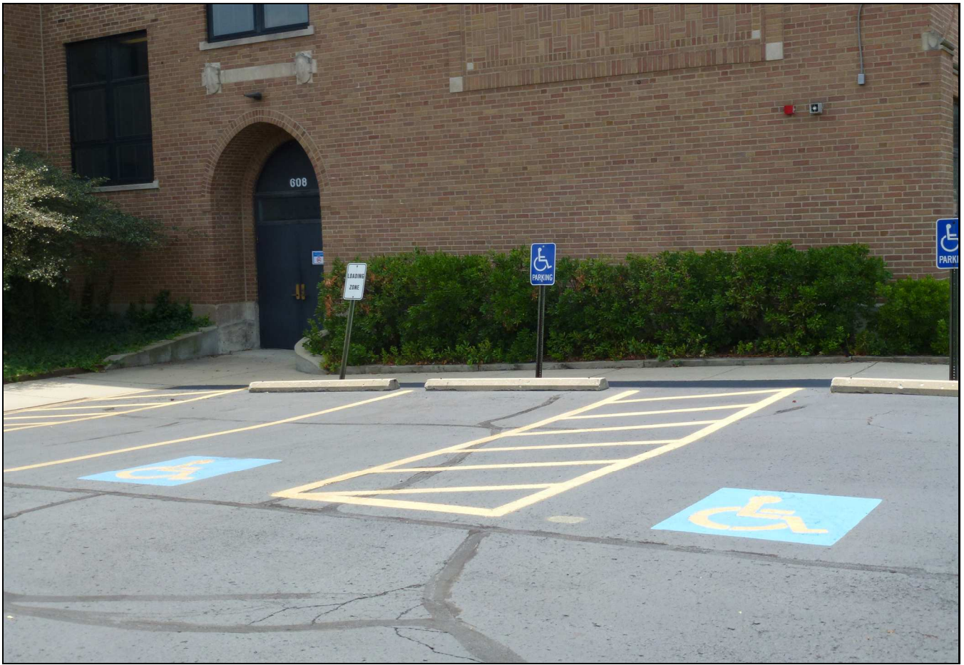
01. Elkhart Health Dept Accessible Parking (2)