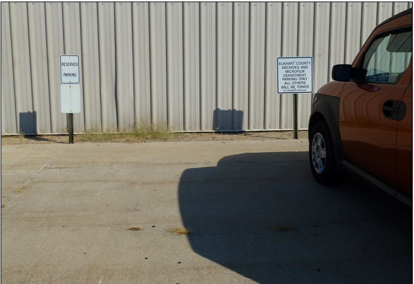
02. Archives Parking lot