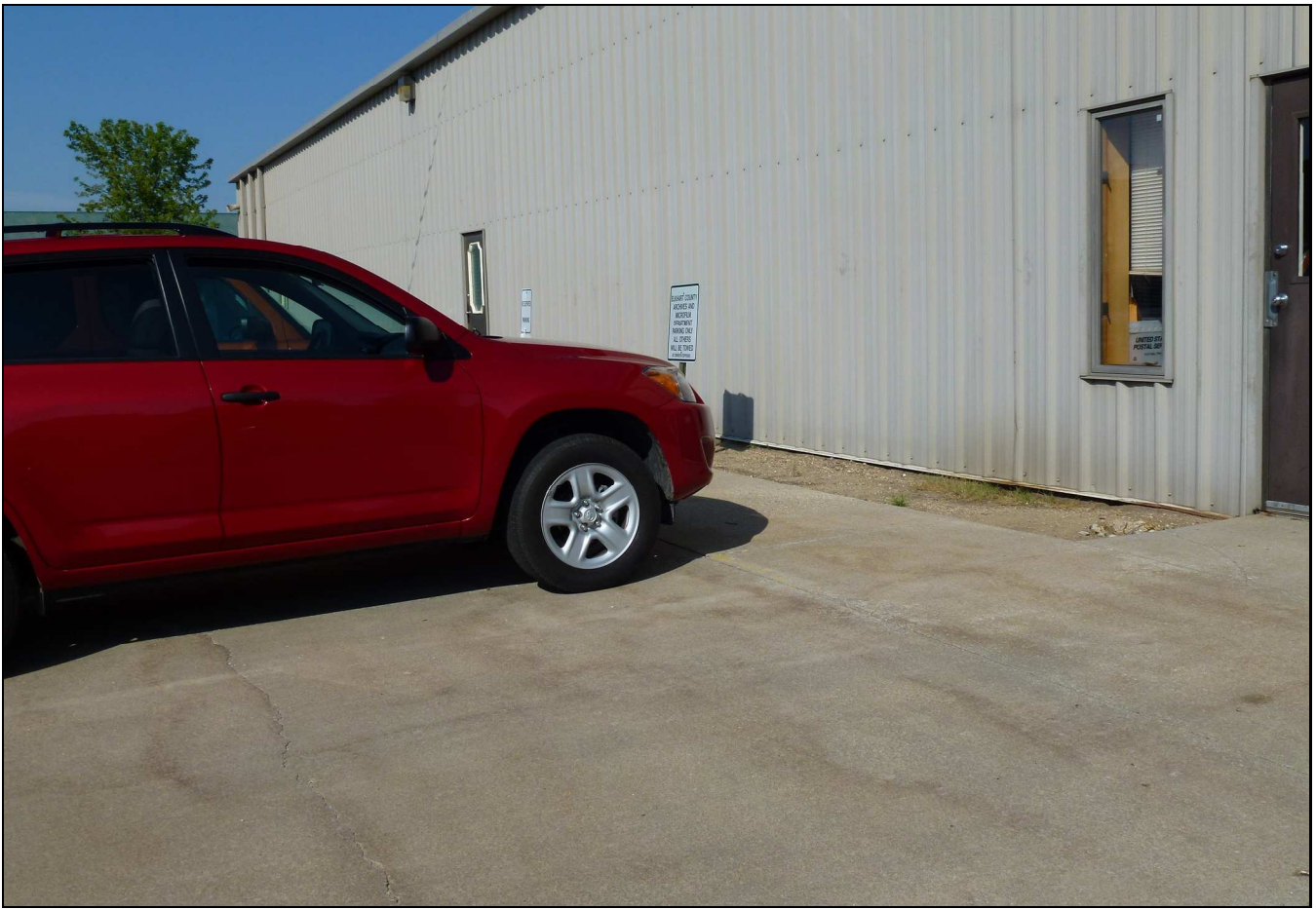
01. Archives Parking