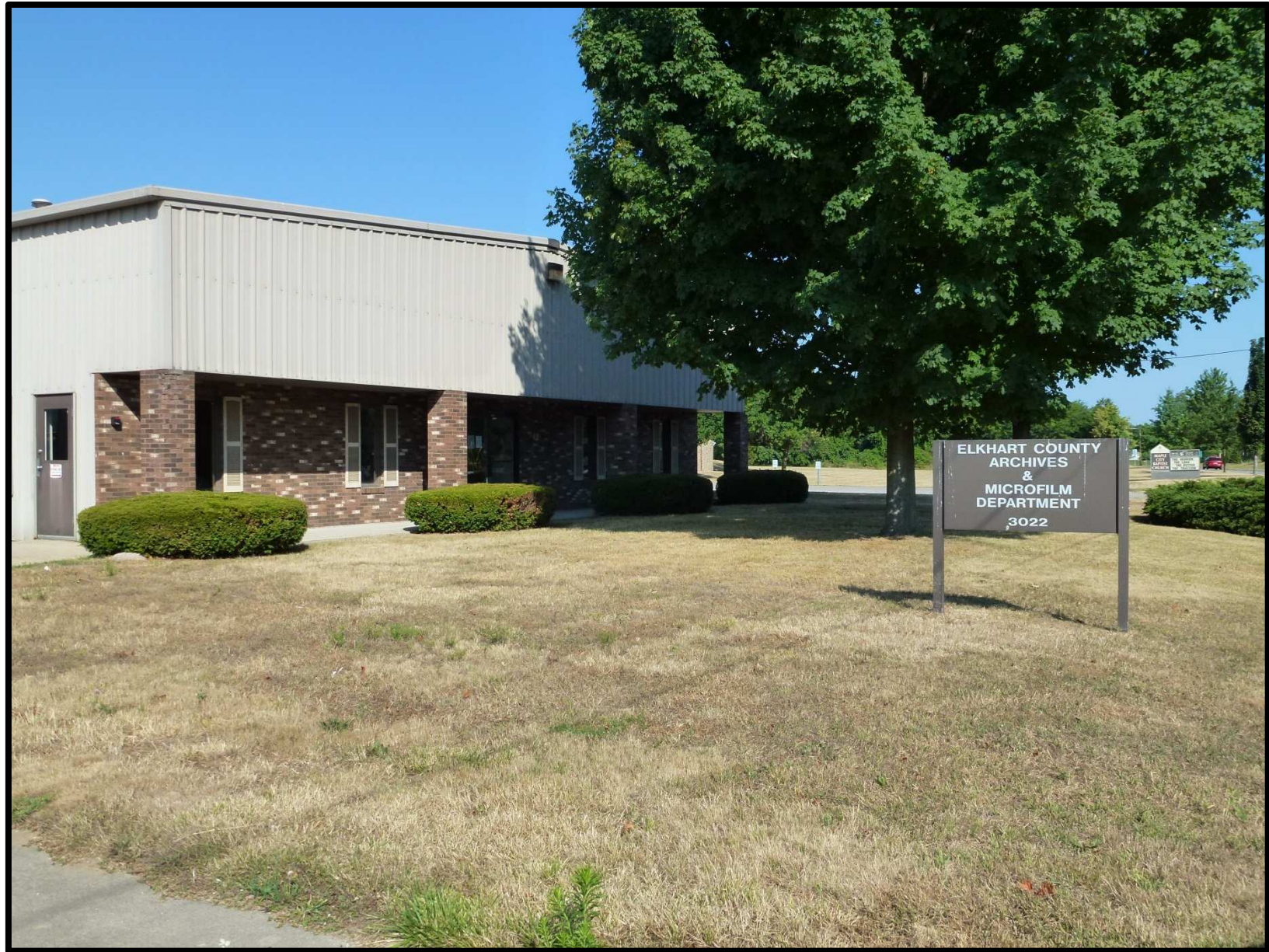
Archives and Microfilm Dept 3022 West Wilden Avenue Goshen, Indiana 46528